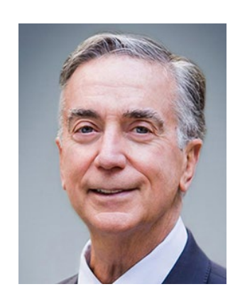
April 8th, 2021: 2:00-3:00pm (EST) "Clinical Trials of Cannabis in Cancer and Sickle Cell Pain: 'Not As Easy As It Looks!""