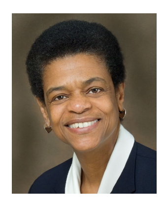
April 8th, 2021: 12:30-1:30pm (EST) "Cannabis Science vs. Policies: Reconciling the Disconnect"

The Cannabis Clinical Outcomes Research Conference will offer 1 CME credit for each of the three Keynote presentations: